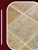
Vinyl & Linoleum