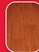
Wood & Laminate